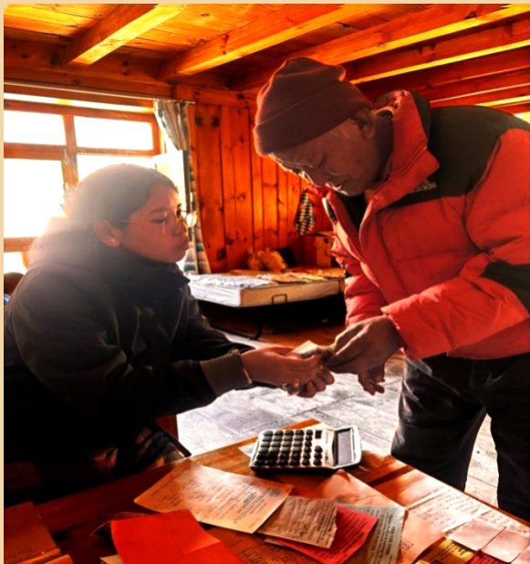
A Medical Team from Central TB Division Paid a Courtesy Visit to the Health Department, CTA