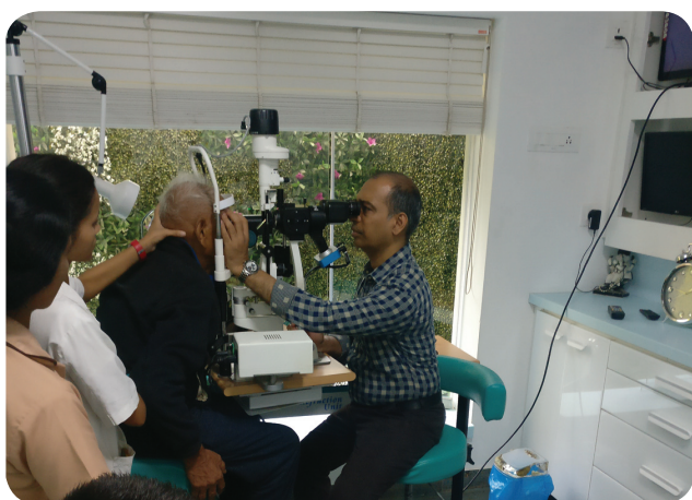
Free Eye Screening & Cataract surgery camp

The Free Eye Screening and Cataract surgery Camp was conducted on 21st August to 2nd October 2018 at Norgyeling Tibetan settlement, Bhandara. Norgyeling Settlement is one of the remotest Tibetan settlements in India and lacks easy access to health care services.